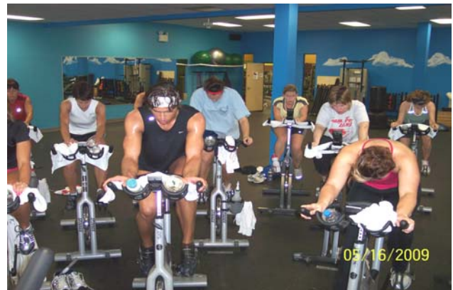
Could they be more focused? NICE!