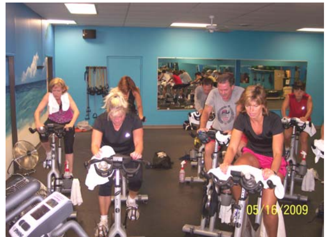
About 50 minutes in..... Lookin good!