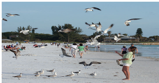
Siesta Key Beach

Keep up the great work to all of our decathletes—finishing this race is an outstanding reward in itself! And you just may be the lucky winner of this view: